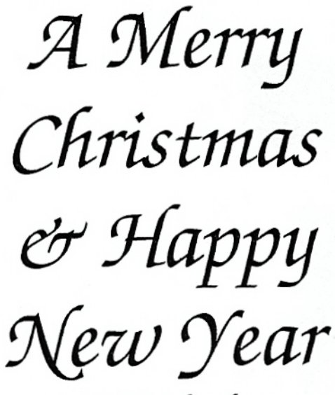
to IPSO Members all over the World

The Newsletter of the International Psion Organiser User Group Volume IV . No. 10 . December 1990 Editorial Office: 130 Stapleford Lane . Toton . Beeston . Nottingham . NG9 6GB . UK