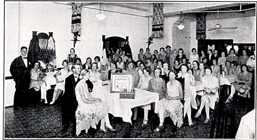
INAUGURATION OF PERTH COMPTOMETER GRADUATES' CLUB, JANUARY, 1930